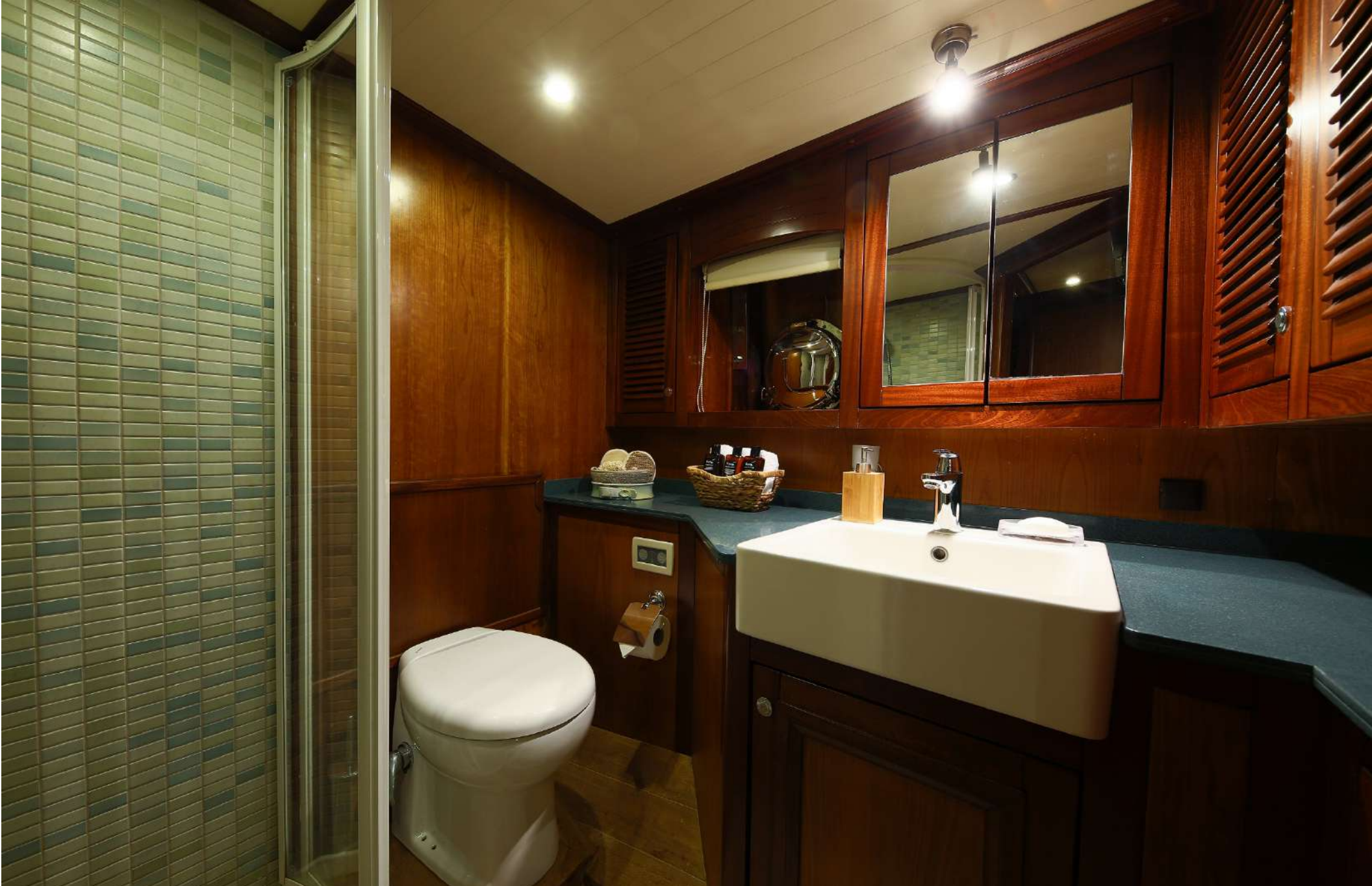
Aft Master Cabin Bathroom