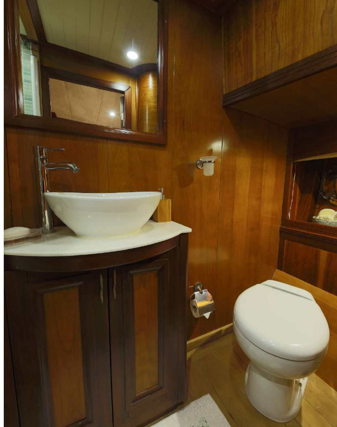
Double Cabin Bathrooms