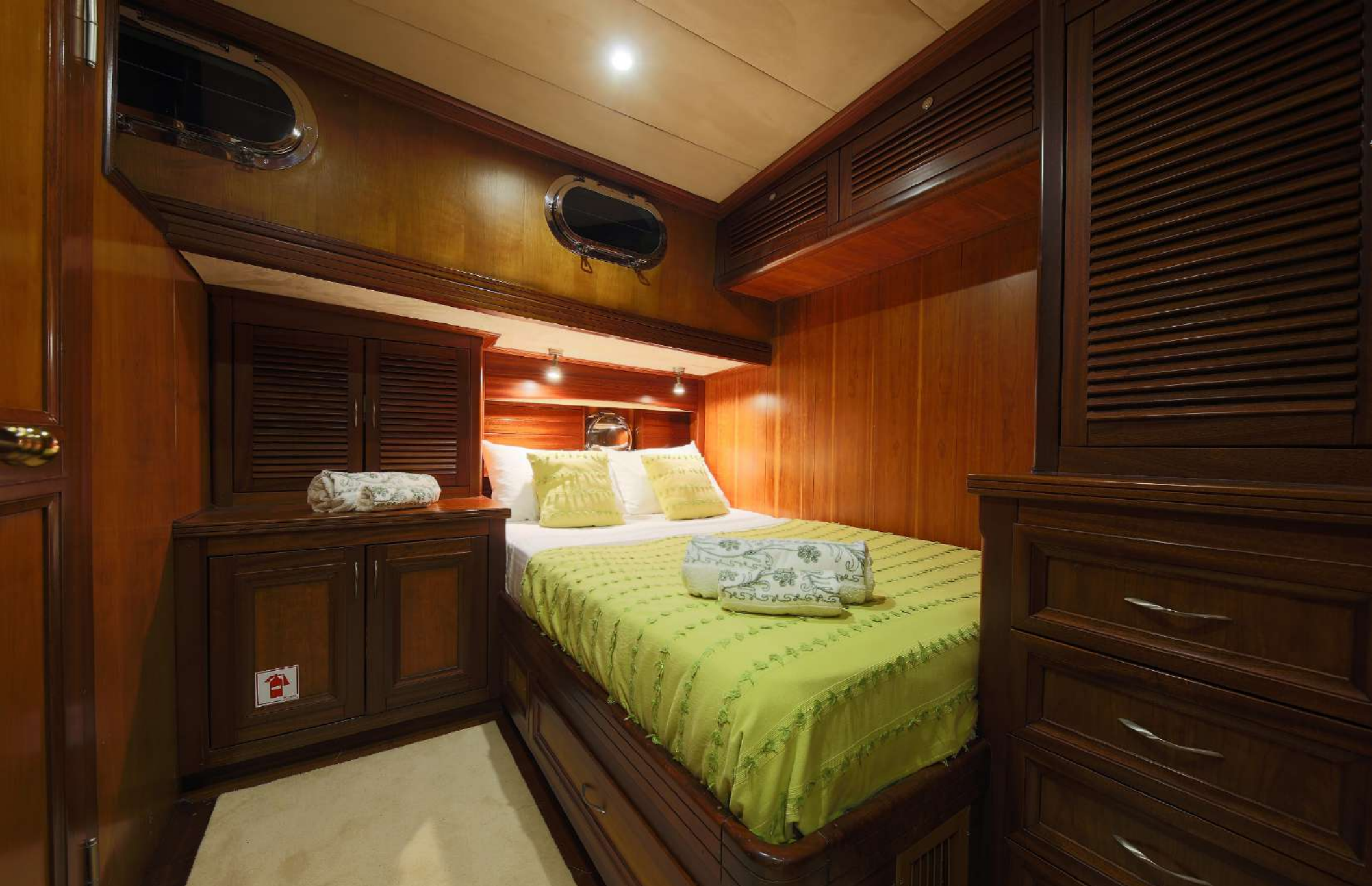
Starboard Side Double Cabin