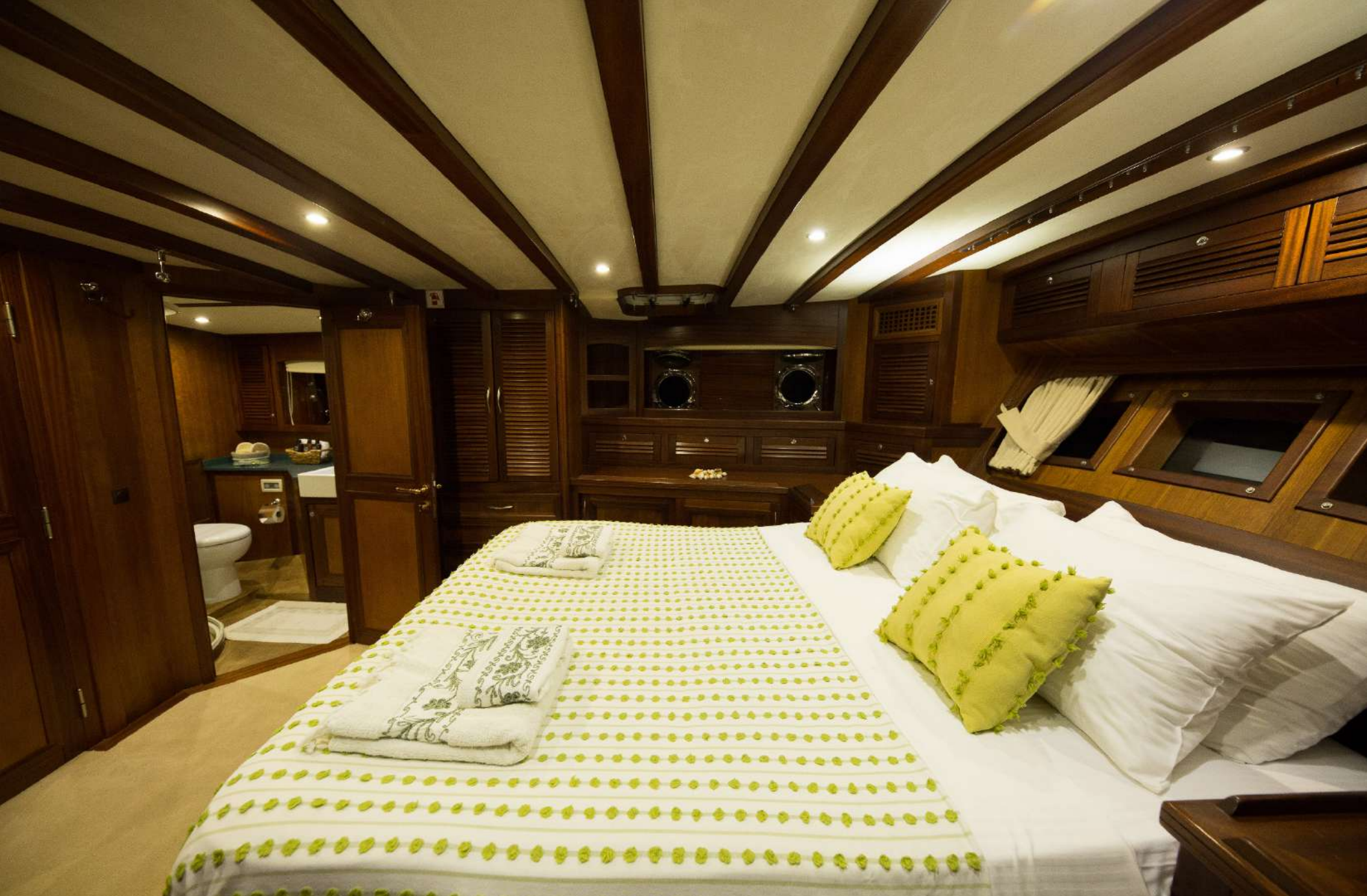
Aft Master Cabin