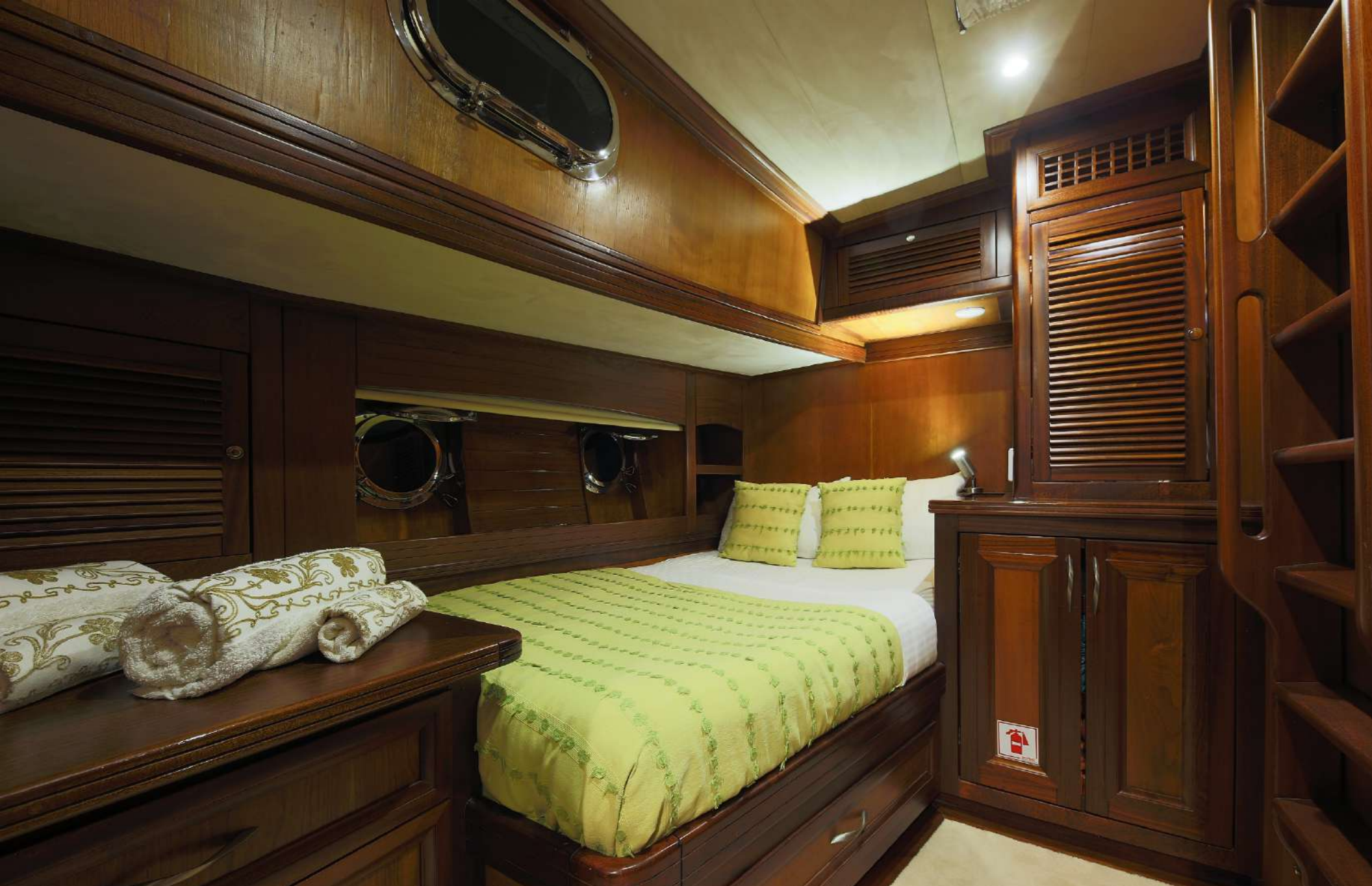
Port Side Double Cabin